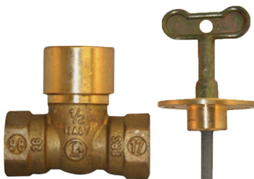
C-67 Brass Log Lighter Ball Valve