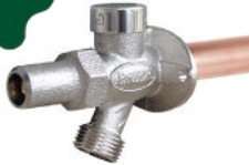
P-264 Loose Key Design